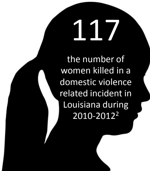
Domestic violence related deaths by gender, Louisiana, 2010-2012 2

In 2013, Louisiana had the 4 th highest homicide rate among female victims murdered by males 1 .